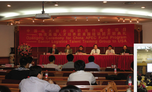
物流高级人才培养项目 2011 年赴美培训团开班典礼 Opening ceremony for Senior Logistic Talent Training group to USA 2011