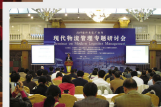
2009 年外国专家广西会议现场 Foreign Experts in Guangxi ,2009