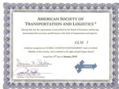
GLM I 助理国际物流师证书模板 GLM I certificate template

Our Goal: To provide practical industry knowledge for those who want to engage in the fields of transportation, logistics, and supply chain industry.